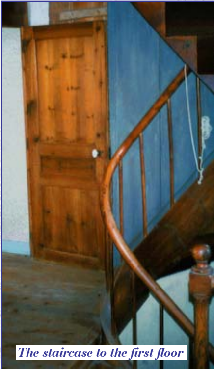
The staircase to the first floor