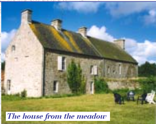
The house from the meadow

Behind the house is a half-acre meadow where you can relax, sunbathe, use the barbecue, play boules . The Saire Valley micro-climate is notably kind to hydrangeas, fuschias and visitors alike. And at night, the stars are truly spectacular as the air is so clean. You can be sure of plenty of peace and quiet in spacious surroundings.