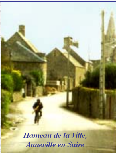
Hameau de la Ville, Anneville en Saire

Half an hour's easy drive from the channel port of Cherbourg, you will find yourself in the lush green countryside of the Saire valley. The river runs through Anneville, a pleasant, tranquil village. A bakery, a bar and a grocery store are a minute's walk from the house, and it will only take you five minutes to reach safe, pleasant beaches.